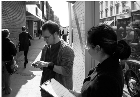
Figure 3. Experimenter (right) and participant (left) at the outdoor location of the on the street study.

completed two studies; a survey using video prototypes and an on-the-street user study that examined the social acceptability of gesture usage based on the locations where gestures might be used and the audiences they might be used in front of. For this initial study, I chose to examine location and audience based on the work of Goffman [1], although there are other factors, such as culture or personality which, could also be investigated. This work describes location and audience as key social factors that help individuals determine appropriate behavior in public places. I used these social factors when developing a social acceptability survey that utilized video prototypes of 18 gestures. These prototypes, with an example shown in Figure 2, allowed me to quickly investigate these gestures without the need to develop gesture recognition code. After watching each gesture video, participants were asked to select from a list the locations where they would use the given gesture and the audiences they would use it in front of. The results, including the responses of 55 survey respondents from 15 countries, showed that both location, shown in Figure 1, and audience played a significant role in determining which gestures were acceptable, with significant differences in acceptance rates between gestures. The results showed the importance of social acceptability, demonstrating that some gestures were significantly more accepted than others.