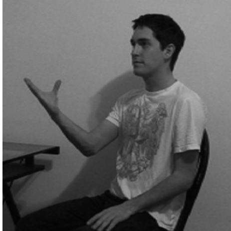
Figure 2. Screenshot from the finger proximity video in the gesture survey.